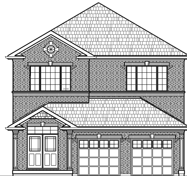
Front ( West ) Elevation