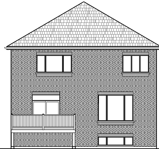
Rear ( East ) Elevation